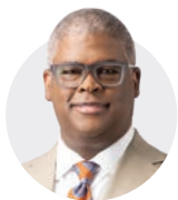
Charles Payne Fox Business' Making Money with Charles Payne

MoneyShow's unique combination of expert speakers, highly qualified investors, select exhibitors, and top financial media partners interacting in a live forum creates a more dynamic marketplace. Our conferences have attracted tens of thousands of investors, traders, and financial advisors over the last 40 years and remains the No. 1 destination for financial education in the nation today.