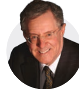
Steve Forbes Forbes Media