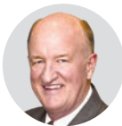
MARK SKOUSEN Forecasts & Strategies