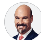
Jon Najarian